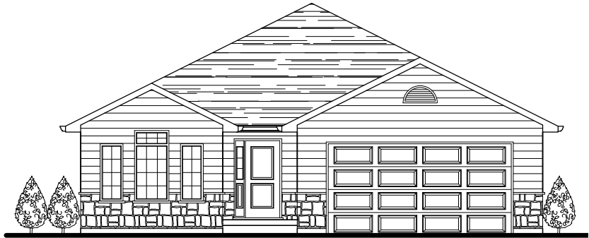
FRONT ELEVATION 'B'