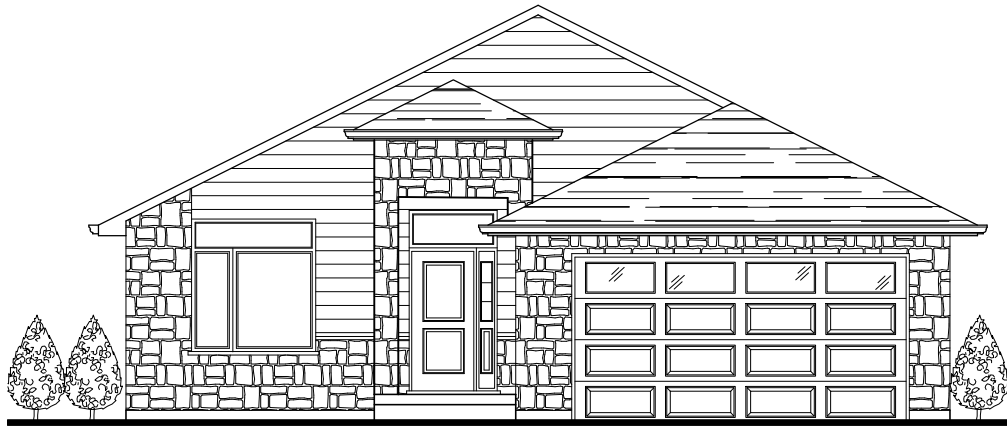
FRONT ELEVATION 'A'