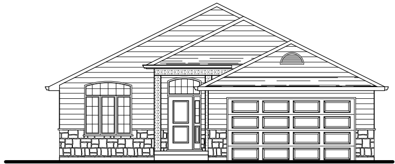
FRONT ELEVATION 'B'