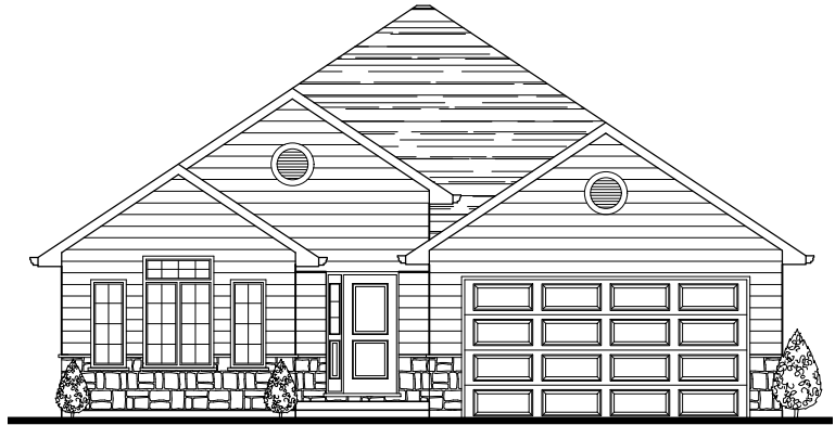
FRONT ELEVATION 'B'