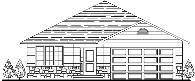
FRONT ELEVATION 'B'